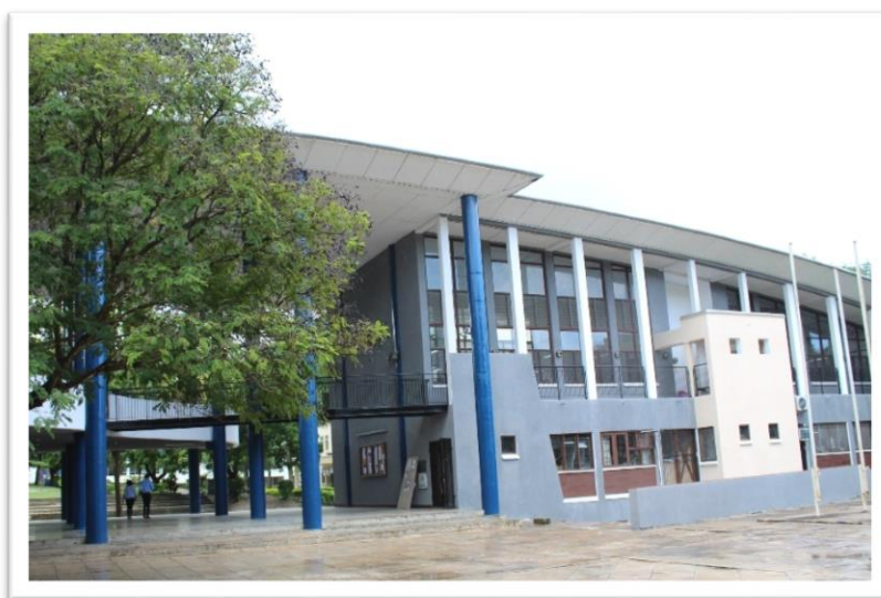
The Arch Plaza

The University has a number of academic units and you will be registered in any one of them. In addition to the general university wide regulations; you will also be subject to the rules and regulations pertaining to the relevant school. For more information on guidelines and regulations pertaining to the Schools please contact your Head of Department. The academic programmes conducted under the Schools are as outlined below;