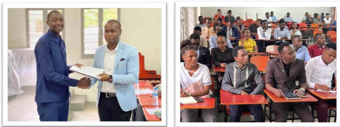
Students' government - handing over portfolios to new government

ARUSO is Ardhi University Students Organisation that is established with the main purpose of safeguarding students' interests. ARUSO government is composed of ARUSO President, Vice President, Prime Minister and Ministers for various ministries who form the ARUSO Cabinet. On the other hand, the Parliament is composed of the Ardhi University Students Representative Council (AUSRC) Speaker, Deputy Speaker, Clerk and Members of parliament. ARUSO President and Vice President, Members of Parliament, AUSRC Speaker, Deputy Speaker and Clerk who are elected annually in the General Students' Elections. ARUSO offices are located at the apron between block A and Block B in the ARU halls of residence.