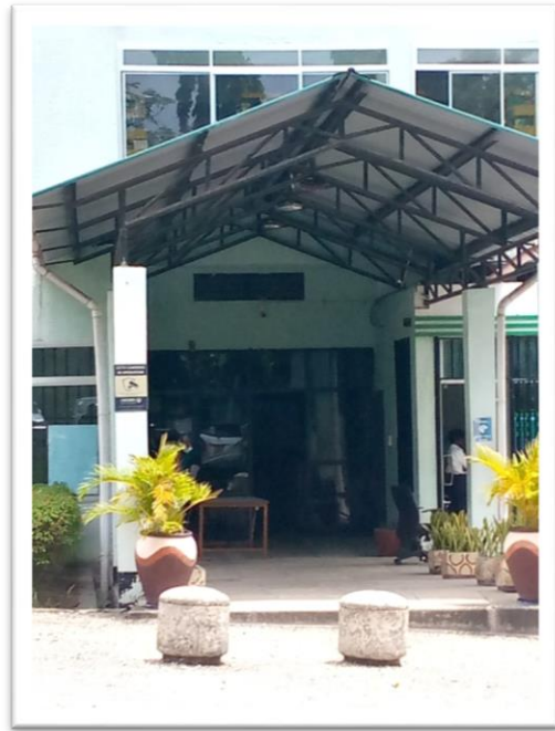
The University Library is open all days during the Semesters at the following times:-