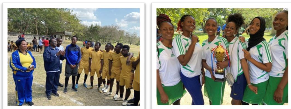
Students Football and Netball Teams

student has to register at the Sports and Games office and will start attending training session as will be arranged by Sports and Games tutor.