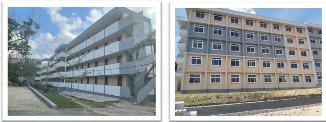
Student hostels at ARU

undergraduate students. Four blocks are for Postgraduate students. Accommodation fees are set by the University and reviewed from time to time as the need be for undergraduate students and postgraduate students. Information for paying accommodation fees can be obtained from the Warden's office which is located at the first floor of Block B.