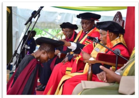
ARU Graduands during the graduation day

You will only be allowed to graduate if you have passed all your examinations, obtained a degree classification in your results and do not