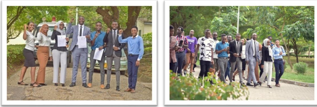
One of ARUSO Elections Process

The electoral committee does all the election programmes such as preparing a schedule, preparing ballots, screening the contestants, monitoring the campaigns and supervising the elections. The Chairman of the Electoral Committee announces the results after the counting of votes is complete. It is worthy to note that there are election rules which govern ARUSO elections.