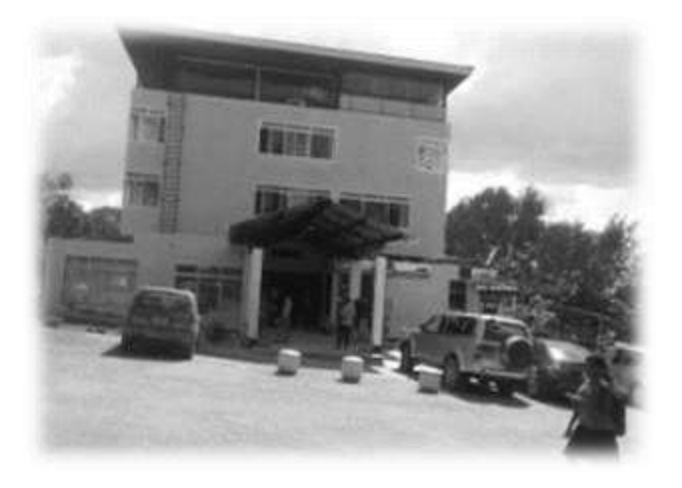
The Ardhi University Main Library

It is also advisable to always carry your ID card with you. You may need it to borrow and read within the library the books that are in high demand such as dictionaries, encyclopedias, handbooks, manuals, atlases, directories, bibliographies and referral text books.