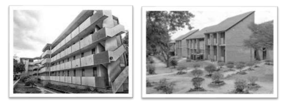
Student hostels at ARU

On campus accommodation includes five blocks for students' accommodation. These are Block A, B, C, D and E for undergraduate students. Four blocks are for Postgraduate students. Accommodation fees are set by the University and reviewed from time to time as the need be for undergraduate students and postgraduate students. Fee for off- campus accommodation (for ARU affiliated hostels) will be introduced to students during arrival at the university. Information for paying accommodation fees can be obtained from the Wardens office which is located at the first floor of Block A.