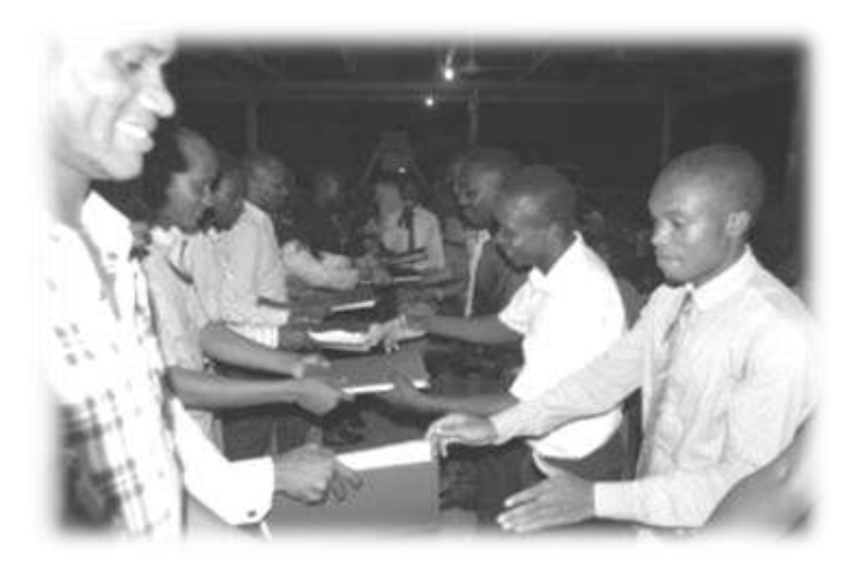
Students' government - handing over portfolios to new government

ARUSO is Ardhi University Students Organisation that is established with the main purpose of safeguarding students' interests. ARUSO government is composed of ARUSO President, Vice President, Prime Minister and Ministers for various ministries who form the ARUSO Cabinet. On the other hand, the Parliament is composed of the Ardhi University Students Representative Council (AUSRC) Speaker, Deputy Speaker, Clerk and Members of parliament. ARUSO President and Vice President, Members of Parliament, AUSRC Speaker, Deputy Speaker and Clerk who are elected annually in the General Students' Elections. ARUSO offices are located at the ground floor of Block A in the ARU halls of residence.