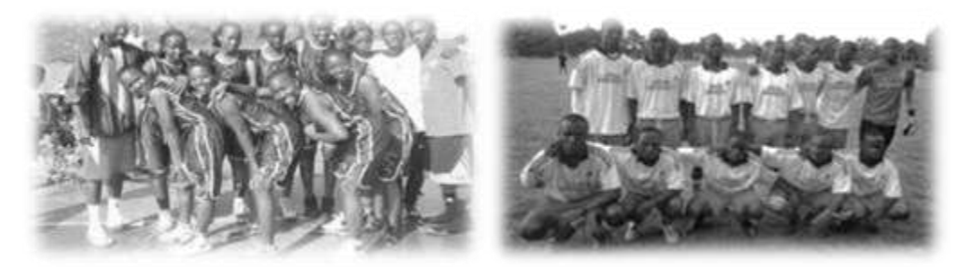
Students Basketball and Football Teams

free to join any club of their interest. The procedure is only that a student has to register at the Sports and Games office and will start attending training session as will be arranged by Sports and Games tutor.