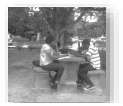
ARU students preparing for examinations