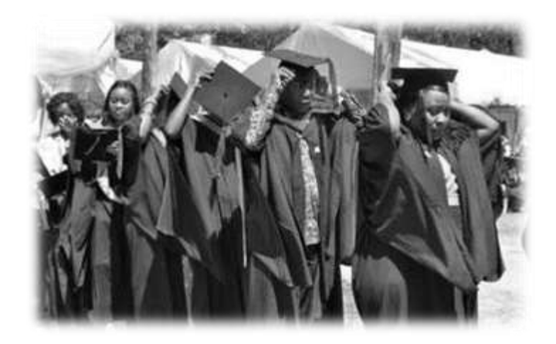
ARU Graduands during the graduation day

After three, four or five years of undergraduate study; depending on the programme you are pursuing youwill be completing your degree and graduating. The Graduation Day is one of the important dates on the University calendar and you may consult the University Almanac on the ARU website to get information on the exact dates of theGraduation Ceremony.